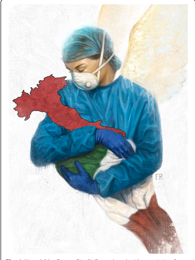
Fig. 1 "Angels" by Franco Rivolli. Reproduced with permission from the author

The bibliographic search was conducted on June 23th, 2021, by one of the authors (ADC). In this review we included articles indexed by SCOPUS using the following string: "AFFILCOUNTRY (Italy) AND (TITLE-ABS-KEY(co-vid) OR TITLE-ABS-KEY (sars-cov-2)) AND (TITLE-ABS-KEY (ICU OR "intensive care")) AND PUBYEAR > 2018 AND NOT (TITLE-ABS-KEY ("case report")) AND (LIMIT-TO (DOCTYPE, "ar") OR LIMIT-TO (DOCTYPE, "re"))".